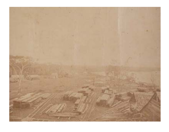
Historic photo of Mill Point

Hibbard, A. & Crosby, E. 1991, Mill Point Conservation Plan, Cooloola National Park, vols 1 & 2, A Report for the Queensland Department of Environment and Heritage, Brisbane, Qld.