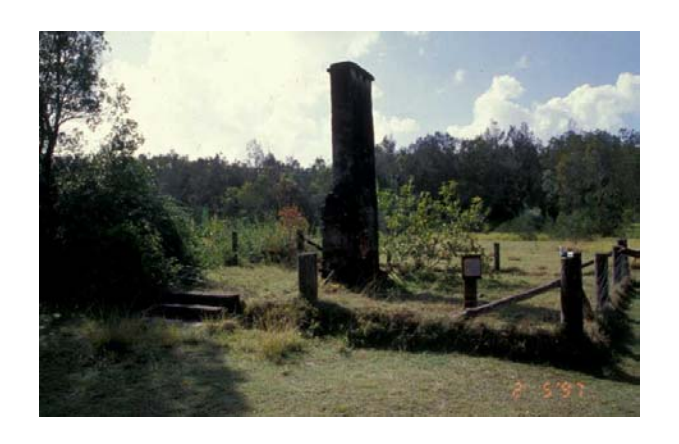
Mill Point remains today