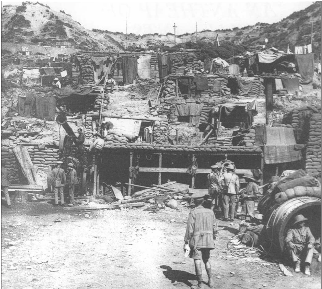
Fig. 2: ANZAC Cove 1915.

This site is of significance as it is directly opposite Quinn's Post (held by the ANZACs). Like the Australians at Quinn's, the Turks held this post from the first day until the allied evacuation. In some places the Turkish and ANZAC trenches