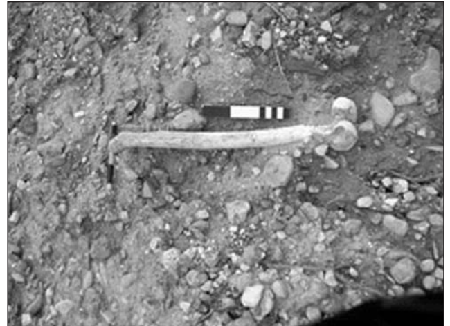
Fig. 3: Femur found in 2003 preliminary survey at ANZAC Cove in the area later bulldozed during the road works of 2005.

at Canakkale and later to the Office of Australian War Graves (OAWG). It is precisely this area that was bulldozed in 2005 as part of the widening of the road immediately above ANZAC Cove. The fact that the OAWG was informed of our finding in 2003 (clearly demonstrating the human remains are present at the site), but failed to take this into account and failed to commission an archaeological survey prior to road works when the proposed road extension works were being discussed and later built, is of particular concern.