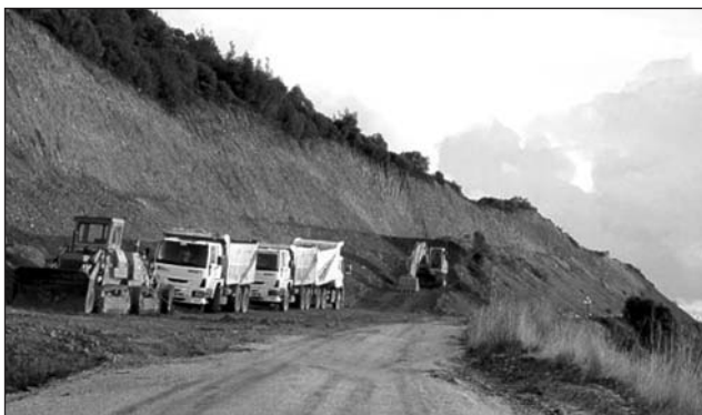
Fig. 4: Same area as Figure 2 during 2005 road works – courtesy of New Zealand Television.

There are also currently unconfirmed reports that future construction works include a plan to grade, resurface and broaden the road along Second Ridge (which runs through no man's land) as well as construct 'viewing platforms' at significant sites like The Nek, Quinn's Post and Lone Pine (Australian Senate 2005). Any work in these highly sensitive areas cannot be justified. Indeed, the regrading of the road and use of associated infrastructure support vehicles will surely result in significant damage not only from the construction itself, but also as a result of processes associated with trampling etc which will disturb, if not outright destroy the resting places of hundreds of officially 'unburied' soldiers the lie in this constricted area.